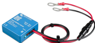
Bluetooth sensing: Smart Battery Sense