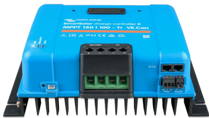
SmartSolar Charge Controller MPPT 150/100-Tr VE.CAN without display