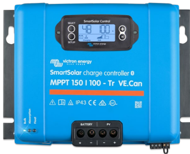
SmartSolar Charge Controller MPPT 150/100-Tr VE.Can with optional pluggable display