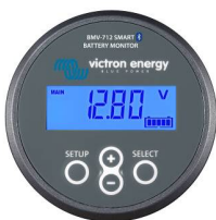
Bluetooth sensing: BMV-712 Smart Battery Monitor