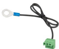
Connector with preassembled DC minus cable (included)